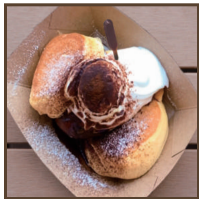
提拉米蘇班戟 TIRAMISU PANCAKE $108