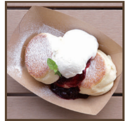
芝士慕絲雜莓醬班戟 PANCAKE with CHEESE MOUSSE & BERRY SAUCE $98