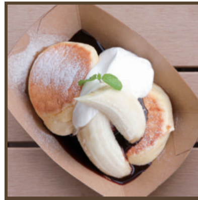
朱古力香蕉班戟 PANCAKE with BANANA & CHOCOLATE SAUCE $89