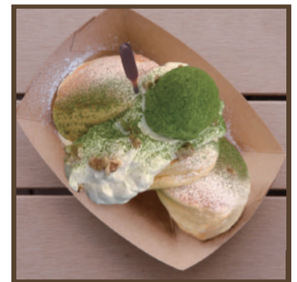
宇治抹茶濃厚慕斯班戟 KYOTO UJI MATCHA THICK MOUSSE PANCAKE $108