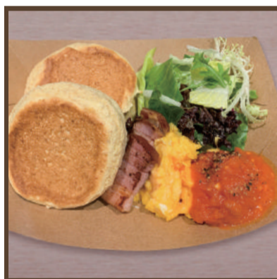
厚切煙肉配炒蛋班戟 PANCAKE with THICK-SLICED BACON & SCRAMBLED EGG $98