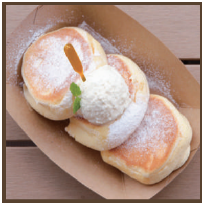
幸福班戟 HAPPY PANCAKE $80