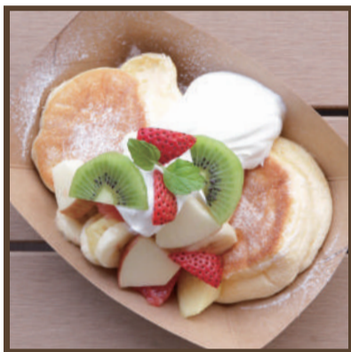
時令鮮果班戟 PANCAKE with SEASONAL FRUITS $108