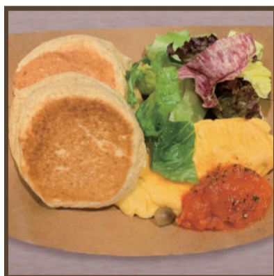
全麥班戟配 芝士蘑菇奄列 PANCAKE with MUSHROOM CHEESE OMELET $98