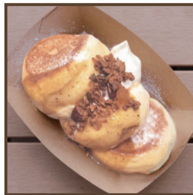
奶茶班戟配自家製穀麥 PANCAKE with MILK TEA SAUCE & HOMEMADE GRANOLA $98