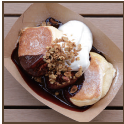
熱朱古力班戟配自家製穀麥 PANCAKE with HOT CHOCOLATE & HOMEMADE GRANOLA $88